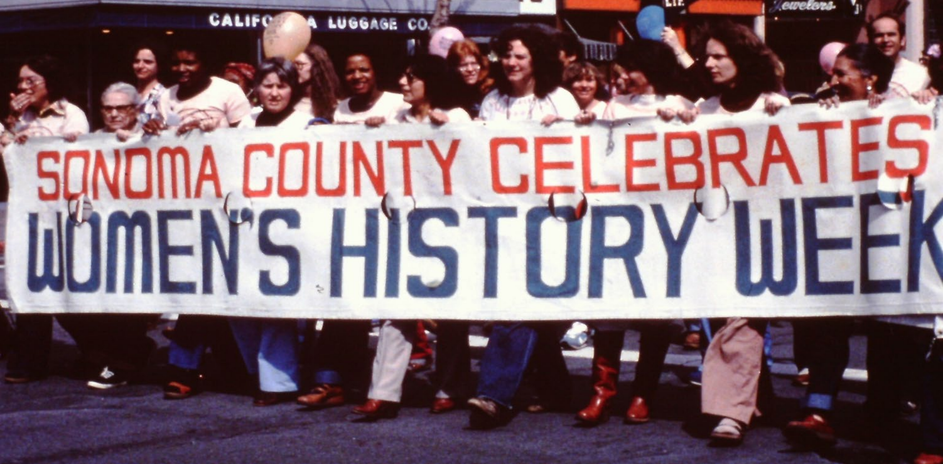
Sonoma County Commission on the Status of Women 4 th Street , March 1978