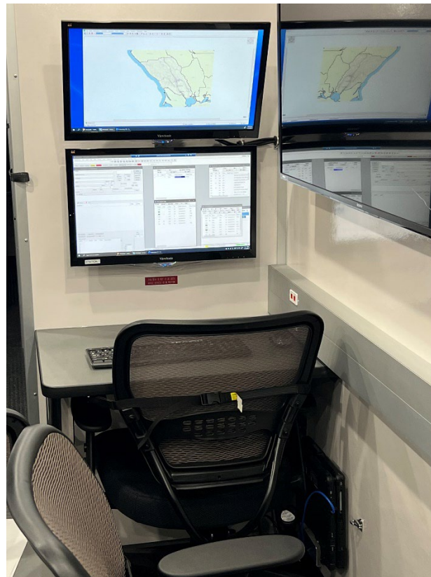
Mobile Command Unit Workstation