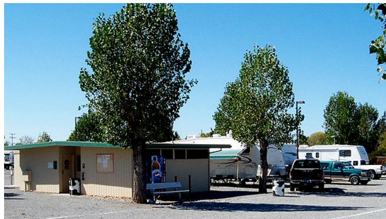
RV Park at Sonoma County Fairgrounds -Maintenance Workers clean and sanitize restroom -Maintenance Workers maintain landscaping in RV Park