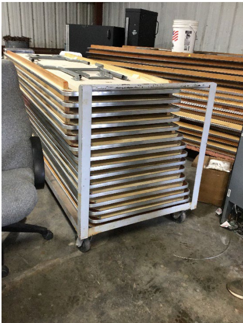
8' x 30'' tables – 61 lbs. each 15 Table Rack/Cart with handle at 42'' high Push Force = 46.37 lbs. Pull Force = 59.37 lbs.