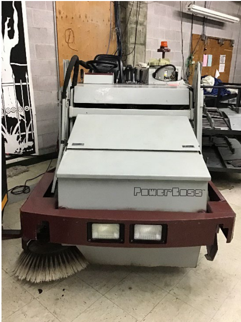
Riding Floor Machine