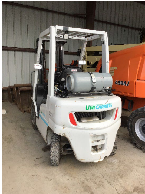
Sample of Forklift used to move large Items and equipment around grounds and facility