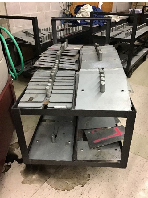
Bases for Exhibit Booths – 10 lbs. Lifted from the Floor to 32” cart