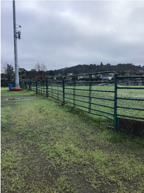
Powder River Horse/Livestock Fence/Gates Up to 153 lbs. per section