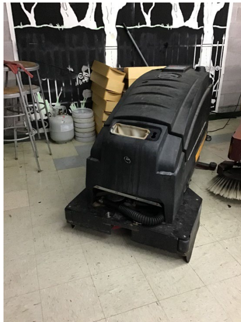
Push from behind Floor Machine