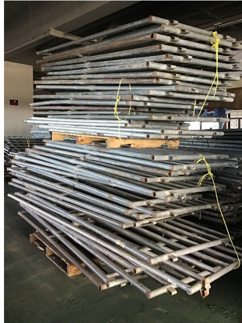
Portable Livestock Fence/Gates for smaller animals; Moved around grounds on pallets with Forklift