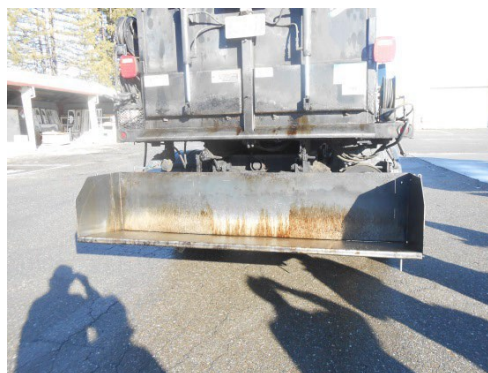
Bobtail Asphalt Patch Truck – 19 inches to lowered gate.