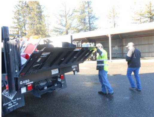
Work Truck with Lift