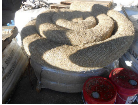
Straw Wattle - 35 lbs.