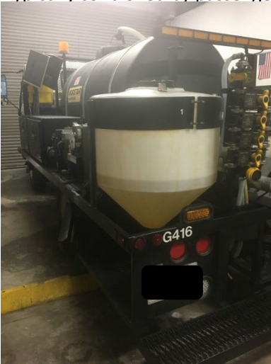
Tank of Herbicide- Top of tank At 64" from floor; 46" from step