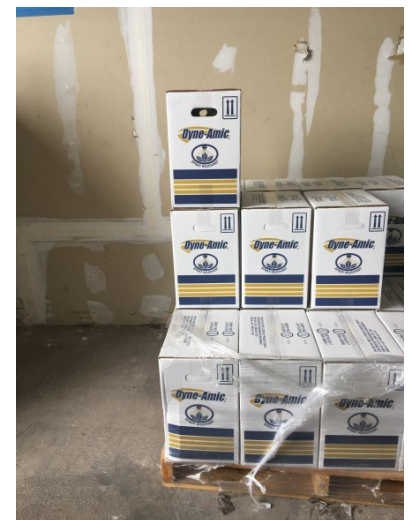
Cases stored from 6" to 52"