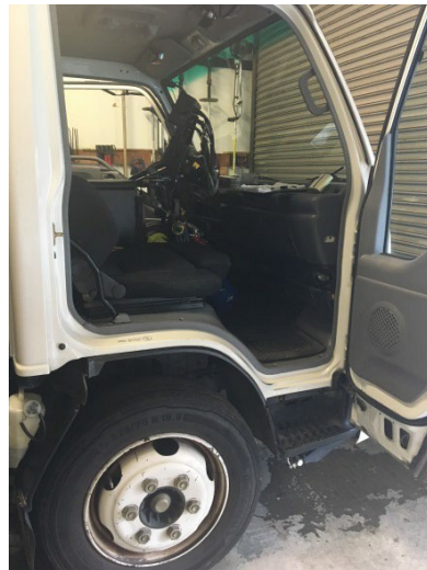
Passenger side of Spray/Tank Truck