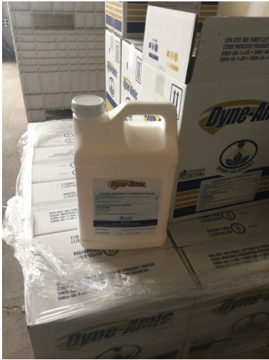
Single container of Herbicide= 18lbs. Moved from 6" pallet to 55" Utility Storage on Pick-up truck