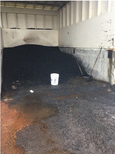
Cold Mix Asphalt Repair Material Shovel and 5 Gallon Bucket for Pot hole repair