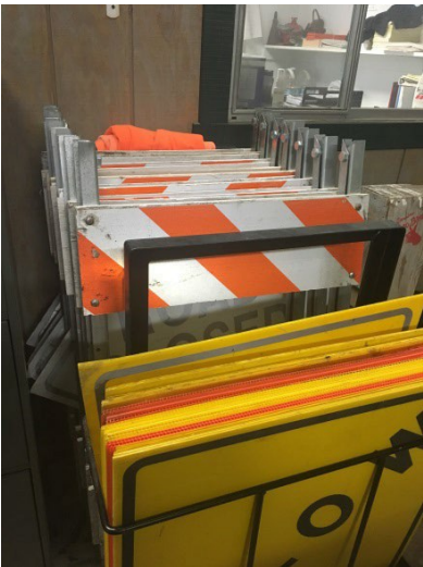
Barricades- 15 lbs.