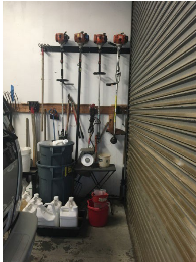
Pole Saw- weighing up to 13 lbs. Weed Whacker- 17 lbs.