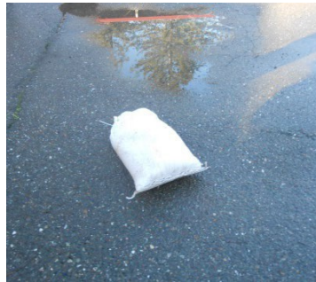
Sandbag- 28 lbs.