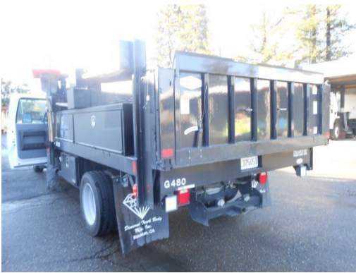
Work Truck with Lift, step to enter Driver's side 16 inches