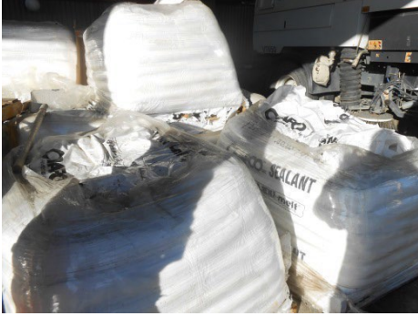
Crack Sealant- 25 lbs. per bag 50 bags per pallet