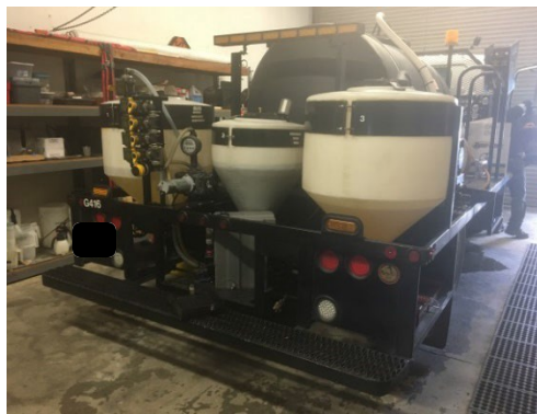
Spray/Tank Truck Step Height- 18 inches from ground