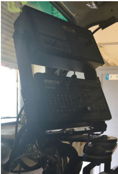
Controls for Spray/Tank Truck- Typically controlled by passenger