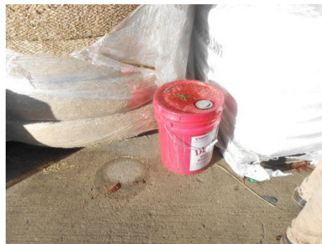
Pavement Finisher Bucket- 40 lbs.