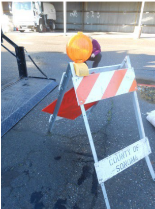
Traffic Barricade with sign- 17 lbs.