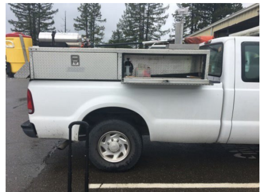
Utility Bed on Pick-up Bottom of Storage at 55" from ground- Storage for Herbicide or chainsaws