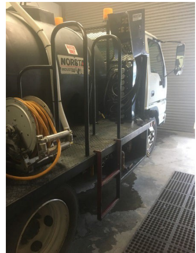
Side of Spray/Tank Truck- Portable Ladder Steps at 12" – 24" – 36" to bed of truck