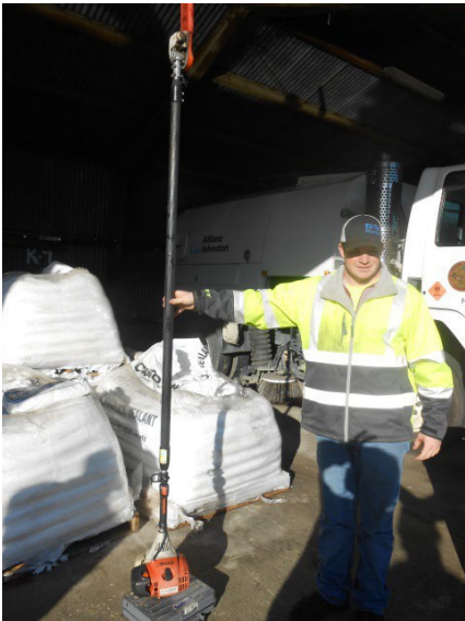
Pole Saw – 17 lbs. Shortest at 107” Extends to max of 180” (15’)