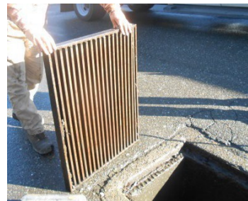
Grate Inlet - Avg.= 100 lbs.