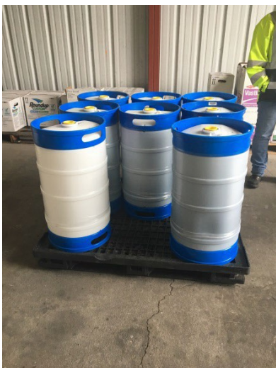
Full Herbicide- 15 gal. = 125.1 lbs. Lowered from 6 in. surface to ground