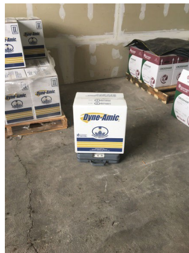
Case of Herbicide- 40 lbs. Case Handle at 13 inches