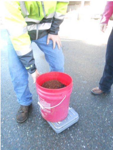
Cold Mix Bucket- 50 lbs.