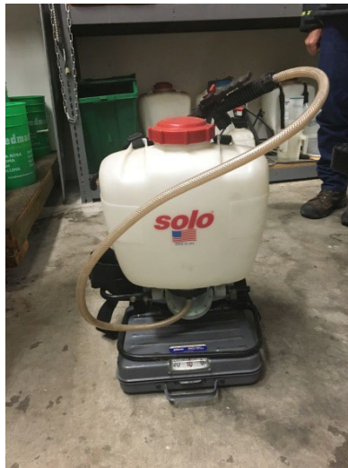
4 Gallon Spray Back Pack- (Typically filled with ONLY 3 Gallons) Empty- 10 lbs.; Plus 3 Gal. - 35 lbs. ; Plus 4 Gal. – 43 lbs.