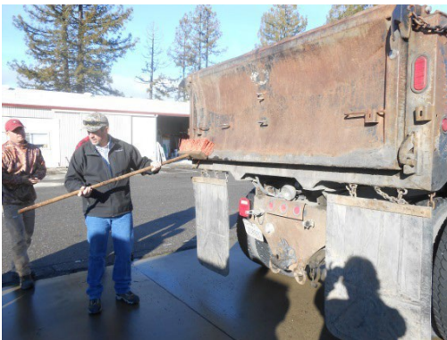
Bobtail Dump Truck- 39 inches to Bed of truck/gate