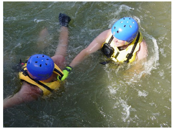
Example Photo 8: Swift Water Training – Grabbing