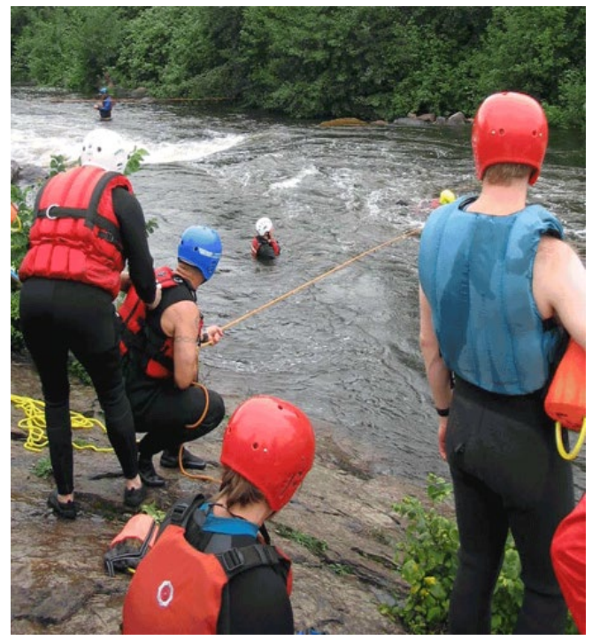
Example Photo 9: Swift Water Training – Rope Pulls