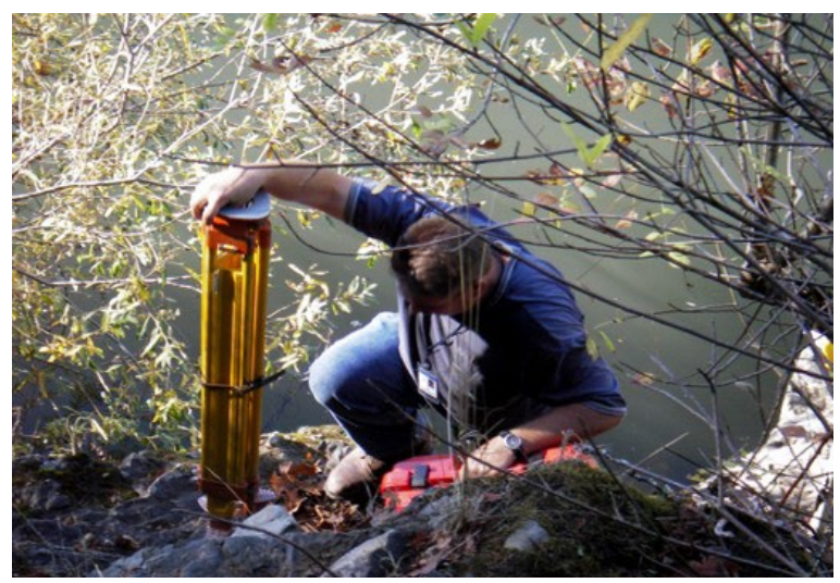
Example Photo 10: Fish Crew SOP Development

*Note: As of this JDAs publication, the Agency uses an external company to provide Swift Water Trainings. While it is desirable for RMAs to know how to give Swift Water Trainings, they are not regularly entering swift water and providing the trainings pictured above (photos 8 & 9)