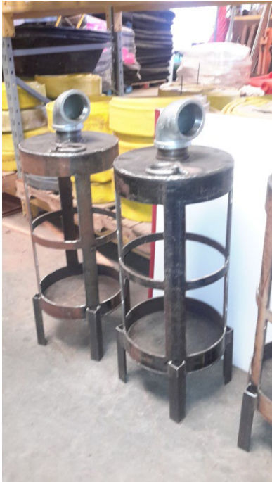
Fish Screen – 70 lbs.