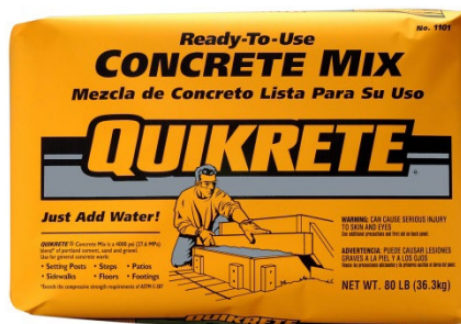
Bag of Concrete Mix- up to 80 lbs. Lift from 6" to 39"