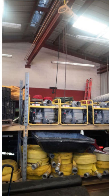
Hoses - 33 lbs., dry