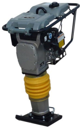
Plate Compactor (Packer) - 141 lbs.; 2 Person lift to back of truck to 39"