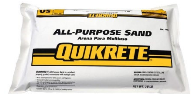
Bag of Sand- up to 80 lbs. Lift from 6" to 39"