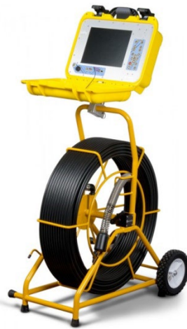
Sample of Video Inspection Equipment

Pictures and measurements from 10/12/2023 visit: