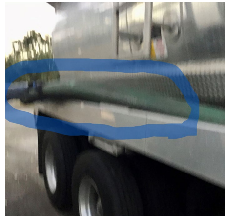
Tanker Truck – Drain Tube = 50 lbs. Team lift or lift & lever up to 58 inches