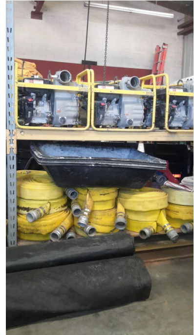
Pumps - 140 lbs. Hoist place on/off shelf