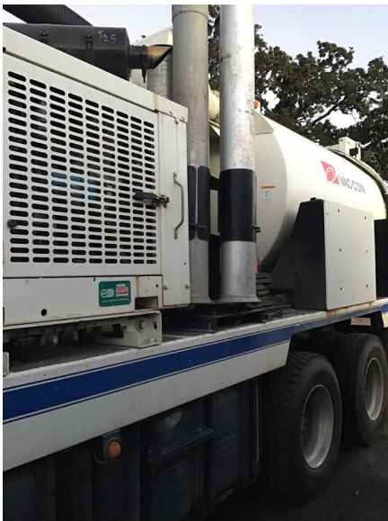
Vac Truck Tubes + 20 & 25 lbs. Lifted up to 60 inches

Pictures and measurements from 10/12/2023 visit: