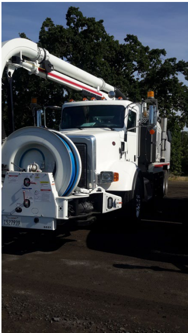
VAC Truck- Lift 5-gallon bucket of gravel up to 50 lbs. ground to 48"