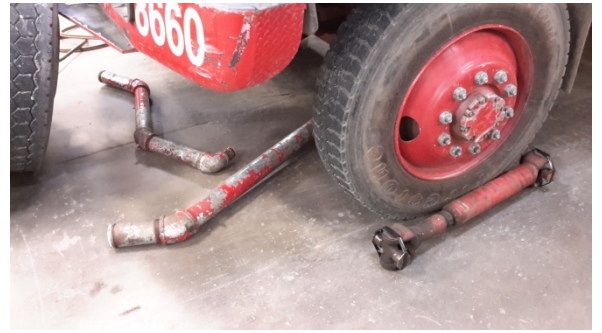
Fire Truck- Water Pipes and Drive Shaft