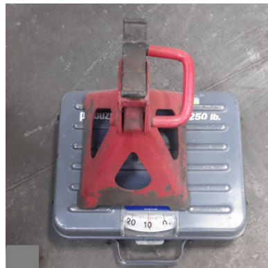
Small Jack Stand- 8 lbs.