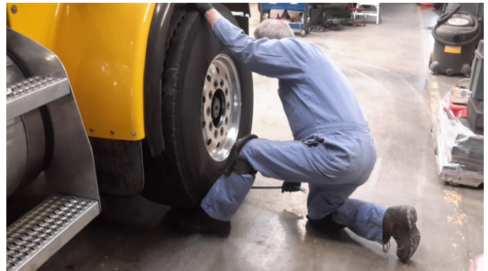
Truck Tire and Rim- 260 lbs.