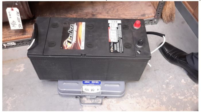
Truck/Heavy Equipment Battery - 93 lbs. Stored on 3 inch shelf (can be difficult to manage in field)