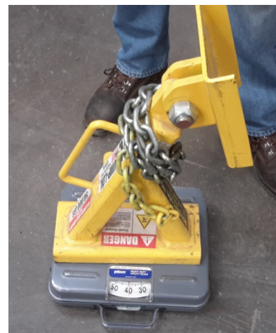
Dump Bed Safety Support- 39 lbs.