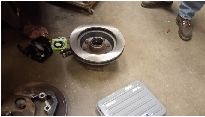
Brake Rotor Hub Assembly- 53 lbs.