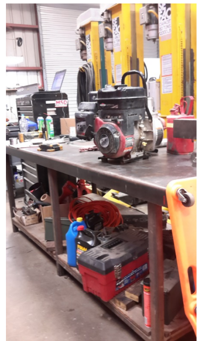
Auxiliary Pump - 65lbs. Lifted 20" to 36" high surface