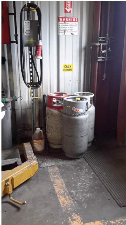
Propane Tanks- 22" at handle 68 lbs. recently filled 37lbs. empty