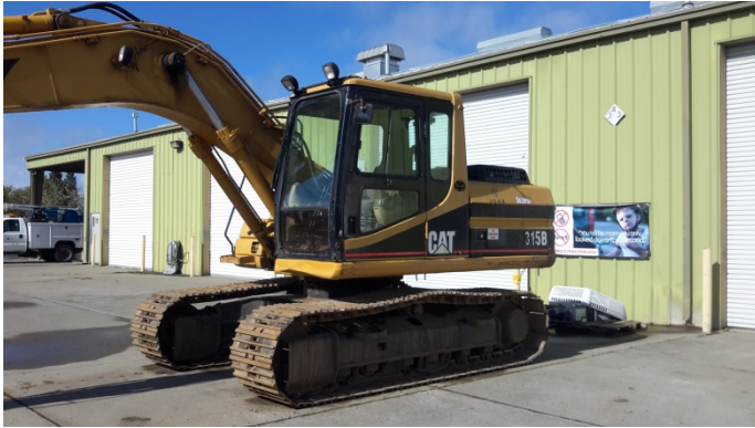
Caterpillar 315B Hydraulic Excavator- requiring repair of Hydraulic Bucket Mechanism