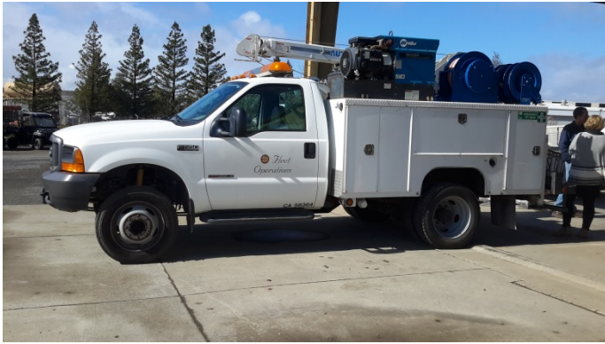
Fleet Operations Service Vehicle