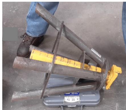
Large Jack Stand- 34 lbs.