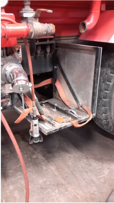
Auxiliary Pump Housing- 20" high