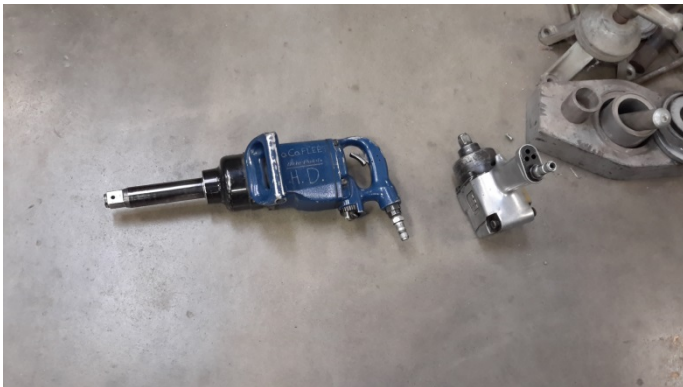
1" Drive Truck Tire Impact Wrench (blue)-27 lbs., as shown 3/4" Drive Truck Tire Impact Wrench (silver)-12 lbs., as shown