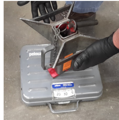
Medium Jack Stand- 14 lbs.