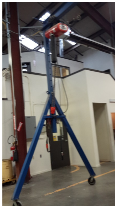
Portable A-Frame Hoist 37.5 lbs. push force