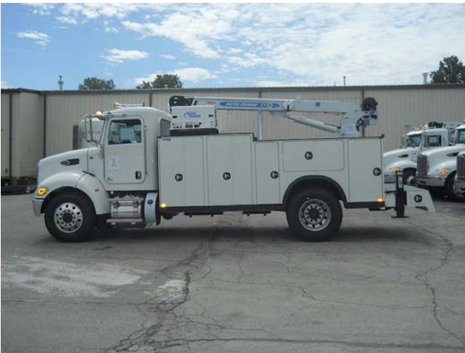
Example of Large Fleet Operations Service Vehicle