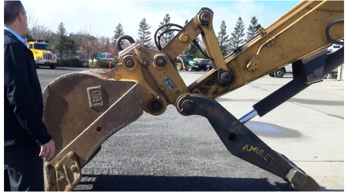
Caterpillar 315B Hydraulic Excavator- Bucket