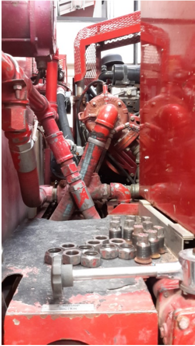
Fire Truck- Tire Lug Nuts Water Pump and Pipes