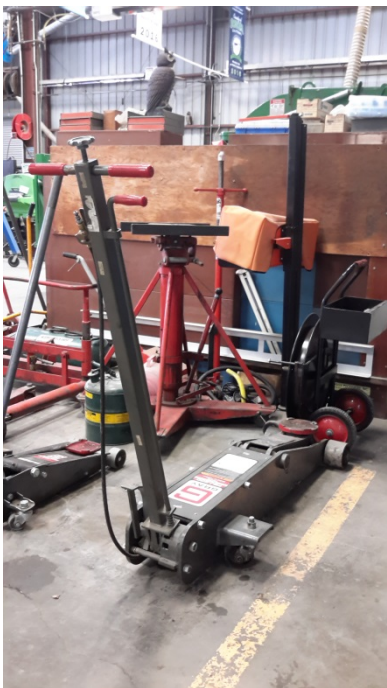
Heavy Duty Jack- 31 lbs. Pull Force 20 lbs. Push Force