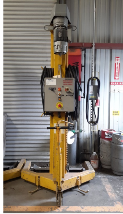
SEFAC- Mobile Column Lift Push Force – 61.5 lbs.