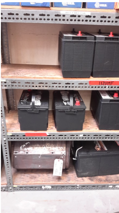
Battery Storage - 44 lbs. to 93 lbs. 3"/17"/34" Shelves