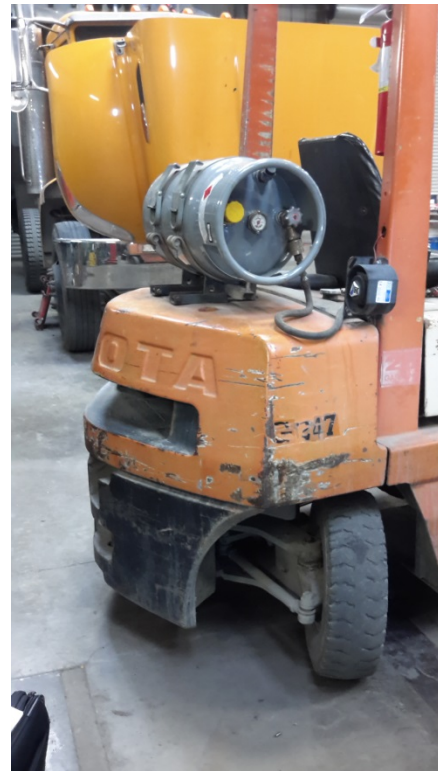
Propane powered Forklift Tanks lifted to 45" high to change