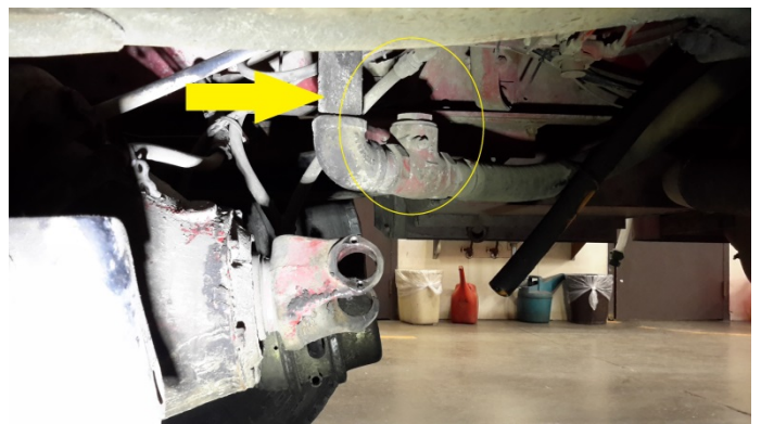
Under carriage of Fire Truck- Water Pump Mount Circled