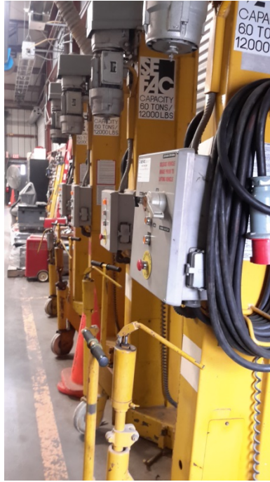
SEFAC- Mobile Column Lifts Pull Force – 66.5 lbs.