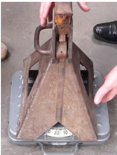
Med/Large Jack Stand- 17lbs.