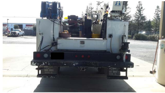
Fleet Operations Vehicle- Steps at 17"/31"/38"/41"