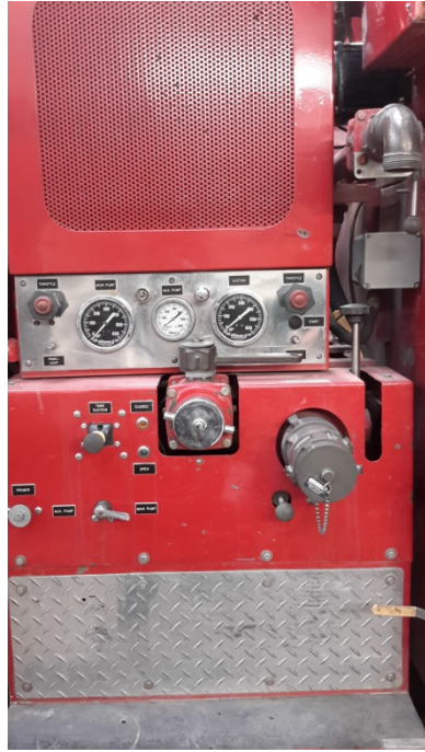
Fire Truck- Water Pressure Guages